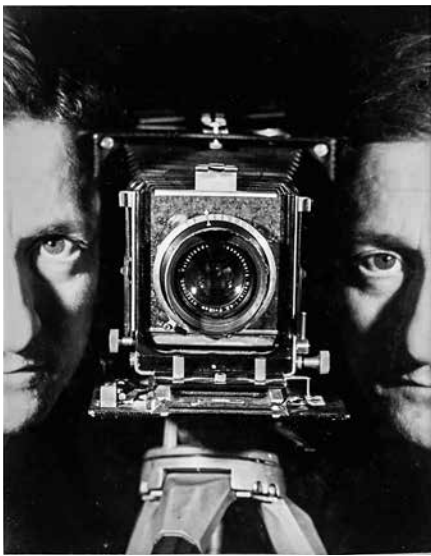
Untitled (Self-Portrait), Paris, c.1938