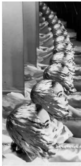
Untitled (Audrey Hepburn, actress), New York, 1950s Switzerland, private collection