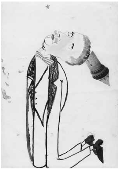
Untitled (Kneeling man with tower), 1920 Collection Henry Blumenfeld