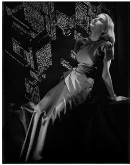
Untitled (Green dress), 1946 Collection Henry Blumenfeld