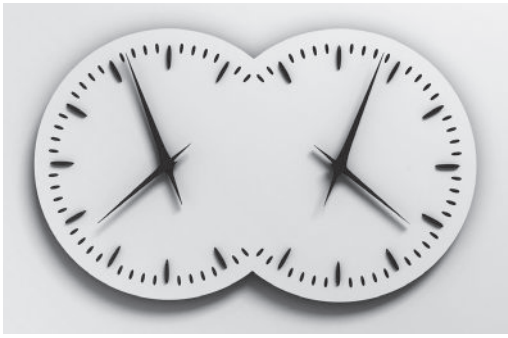
Les Inséparables , double clock, 2000–10 Production La Manufacture Jaeger-LeCoultre