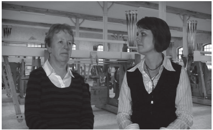
Sound Machine , video still, 2008