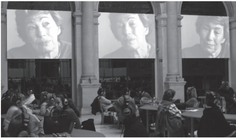
Between Listening and Telling: Last Witnesses, Auschwitz 1945–2005, 2005 Installation view at Hôtel de Ville, Paris, France, 2005

economic laws so as to make the market works properly. When this installation was first made, on the Adenauer Bridge in Brunswick in 2000, there was a stock market crash preceding the introduction of the euro.