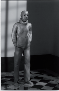
Echoes in Memory , photograph, 2007