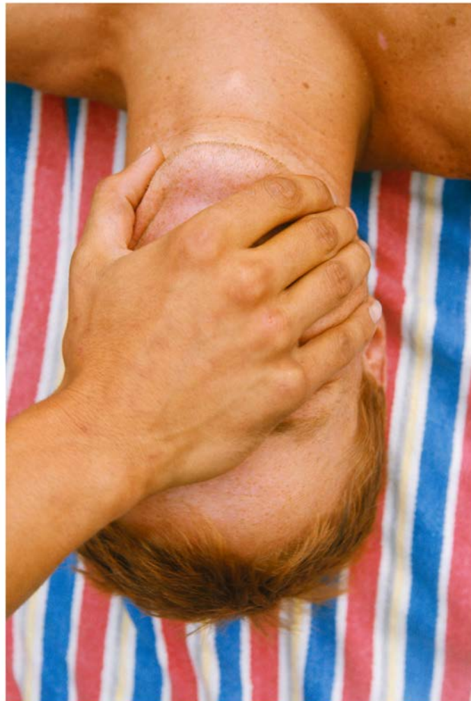
4. Walter Pfeiffer Untitled, 1975 © Walter Pfeiffer